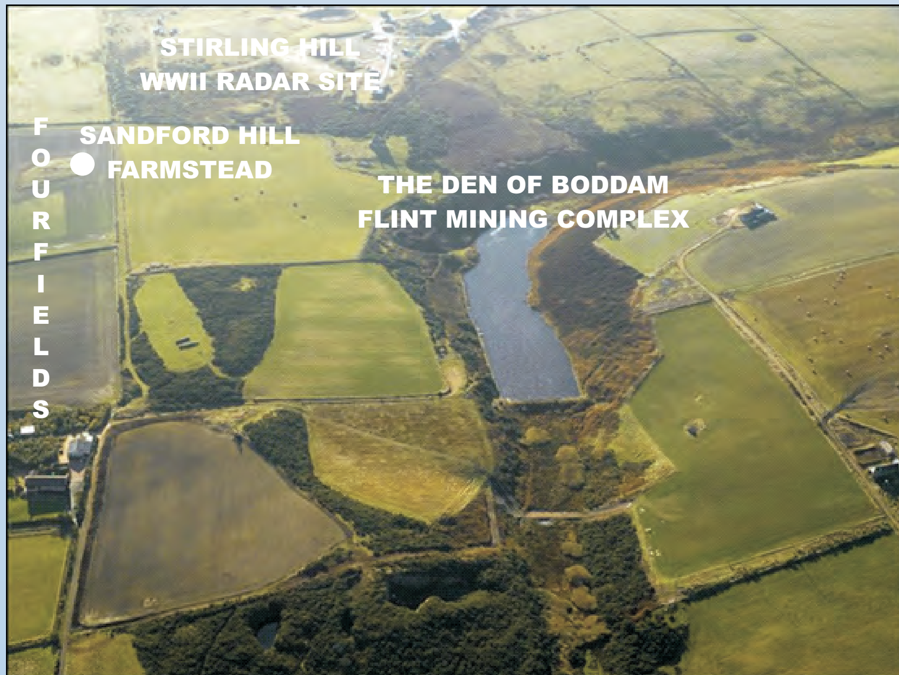
Aerial photo showing the Den of Boddam surrounding the reservoir. RCAHMS Aerial Photography Digital Oblique aerial view centred on the reservoir and the remains of the flint mines, taken from the NNE. DP011672

The remains of the railway embankment built between the quarries at Stirling Hill and the breakwater at Peterhead port was specifically avoided during the selection of the HVAC cable route. The site cannot be seen from Boddam Castle or Buchanness Lighthouse, hence they will not be impacted by the development.