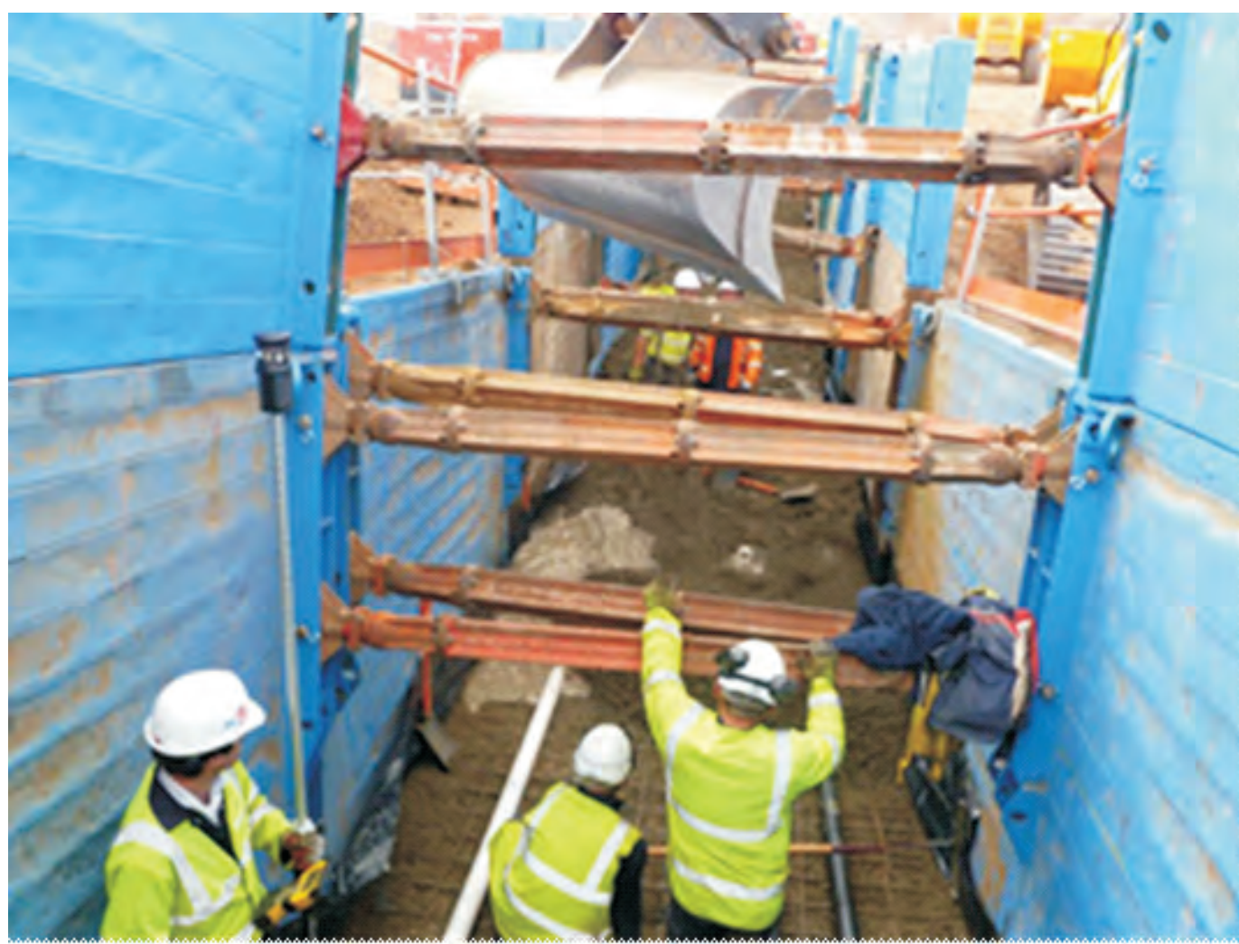
Typical Excavation of 400kV Ducts

A minor road will need to be crossed and works will be condensed into as short a time frame as possible. All local residents will be made aware of the timing of the works and appropriate diversion signage will be provided. To cross the road a trench will be made and ducts installed which are set in concrete. The trench is then backfilled and the road reinstated.