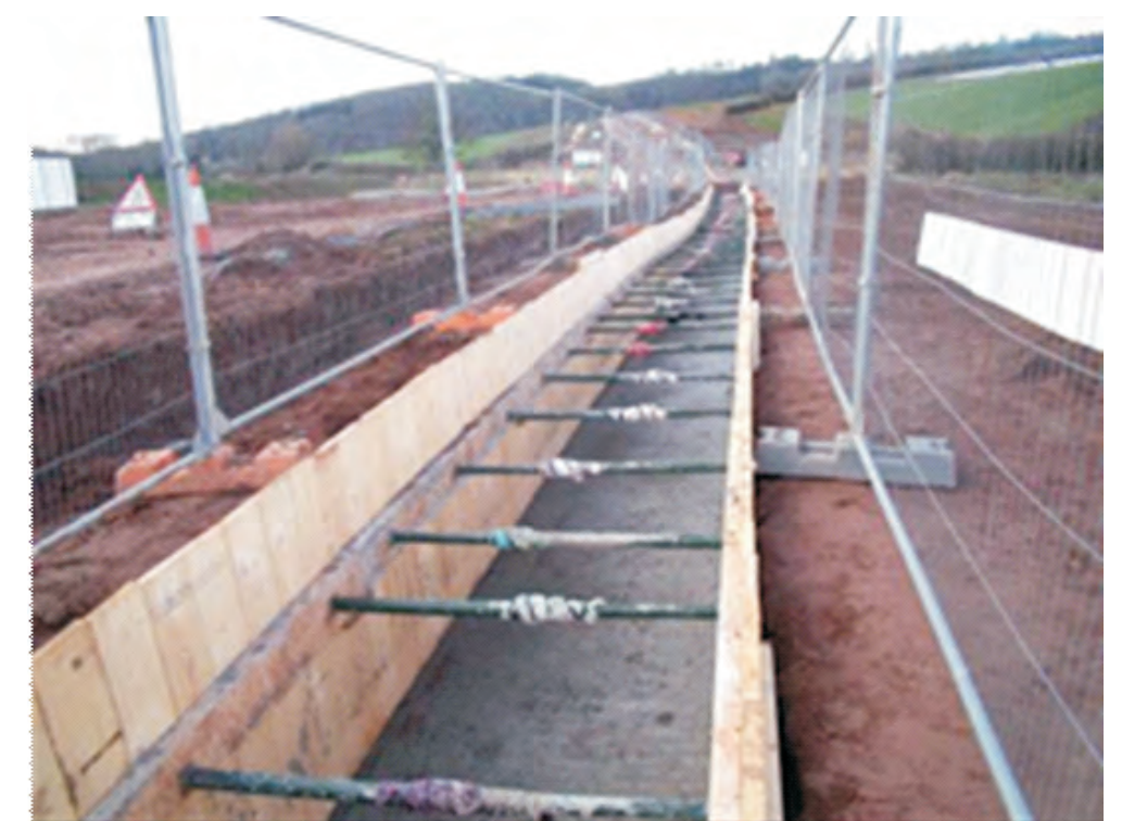
Boarded Cable Trench, Temporary Access Road and Drainage Ditches

As part of the works, the topsoil for the cable route and temporary track is removed and put into stockpiles along the route. This is to allow the indigenous topsoil to be reinstated at the end of the works. Once the topsoil is removed, the temporary track is established to allow access for digging and cable laying vehicles and machinery.