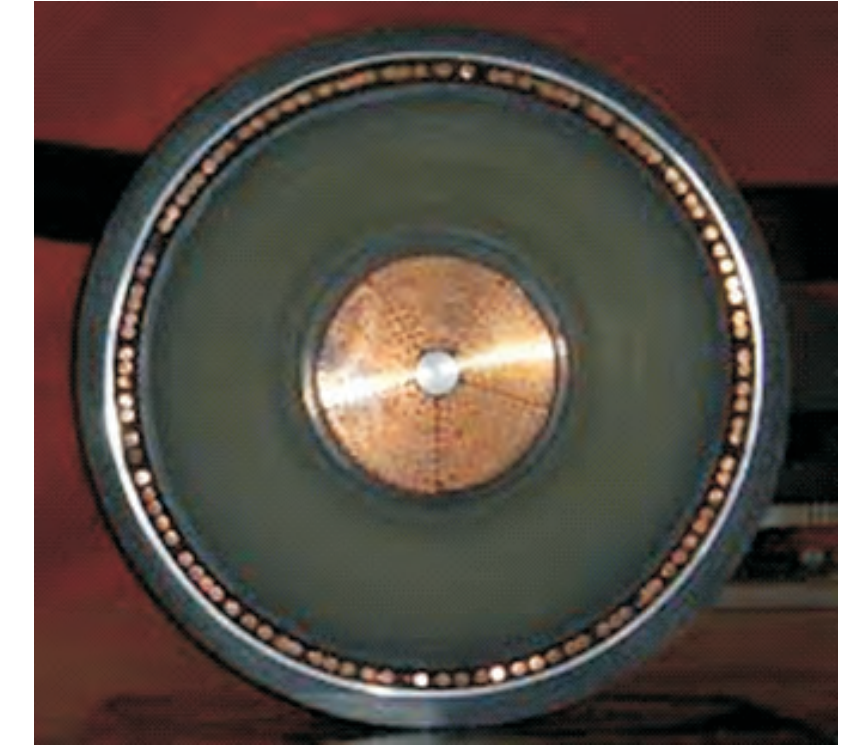
Cross Section of HV Cable

The cable route follows field boundaries wherever practicable. There will be a need for two streams to be crossed. The streams will be culverted during installation works and all precautions taken to minimise impacting on the water quality and the ecology of the surface watercourses.